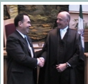
Sen. Olson & Speaker of the Yukon Legislative Assembly

SB 43 will extend the termination date for the State Medical Board for another 4 years. The termination date is called a sunset provision that forces the legislature to periodically review and assess the board's performance. I think it is important for the board to continue its work, particularly the licensing function. This is especially important for rural Alaska where health care facilities and services are growing dramatically. I am also pleased with presence of a Physician's Assistant on the board. I feel that the PA perspective on rural health care is an important contribution to the board's deliberations.