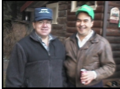
Senator Hoffman with Senator Olson Enjoying the NAB Picnic